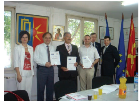
From the PPP feasibility study submission at the LSG Gorce Petrov

CEA and NEOL Consult have developed the first feasibility study for Public Private Partnership in Macedonia for municipality of Gorce Petrov.